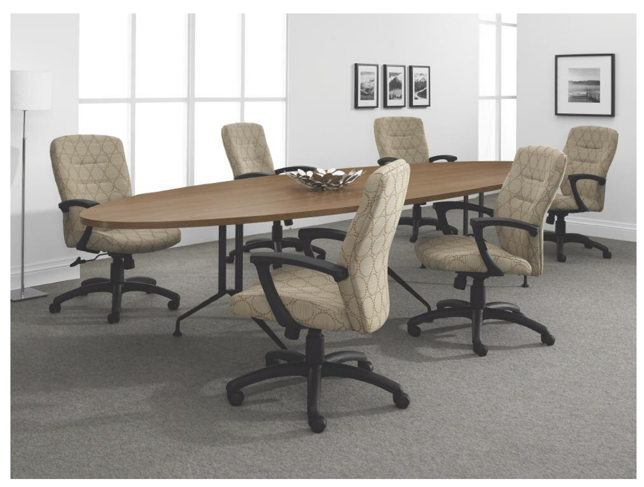
Above: 5091-4 Medium Back Tilter in Momentum, Melodeon Stucco (09117304) and EL12WS Alba Table in Winter Cherry (WCR) with Black base. Cover: 5080-3 High Back Multi-tilter shown in Allante, Medium Beige (A27E) and 5091-4 Medium Back Tilter shown in Mayer, Bar None Moonbeam (873-002).