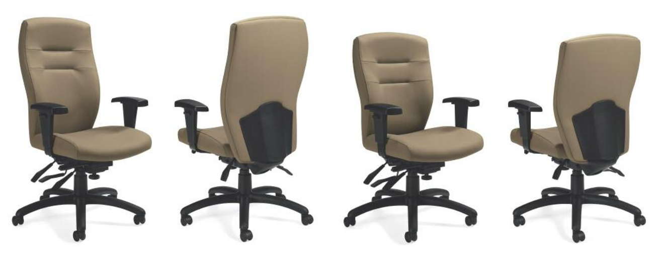
5080-3 High Back Multi-tilter in Allante, Medium Beige (A27E) with Black base.