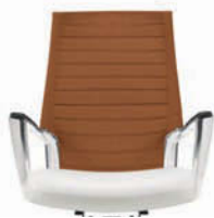
Orange Sunset (VU12)