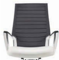
Quarry Grey (VU15)