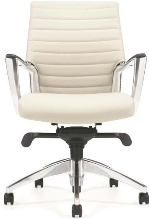
2671-2 Medium Back Knee-tilter in Allante, Bisque (A42E).

Global Accord is an elegant and refined seating series designed by Zooney Chu. Global Accord features a finely detailed polished aluminum arm with a sling style back, upholstered with rolled and pleated details, and is available in an array of fabrics or fine Italian leathers. Clean simple lines make Global Accord the perfect choice for meeting rooms, boardrooms and private offices.