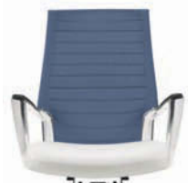
Arctic Blue (VU14)