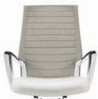
Desert Sand (VU11)