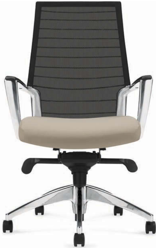
2676-2 High Back Knee-tilter Mesh in Allante, Light Parchment (A31E).