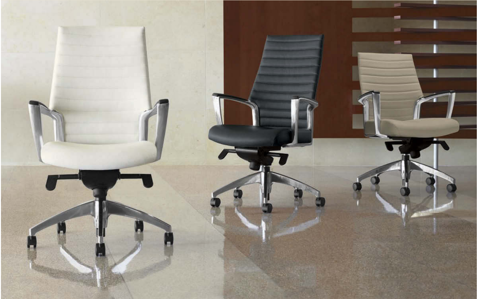
Shown above, left to right: 2670-2 High Back Knee-Tilter in Softhide White Sand (S045) and Smoke (S046). 2671-2 Medium Back Knee-Tilter in Allante, Light Parchment (A31E). Cover: 2670-2 High Back Knee-tilter shown in Softhide White Sand (S045) and 2676-2 High Back Knee-tilter Mesh shown in Vue, Desert Sand (VU11), seat in Ultra leather, Ermine (UL27).