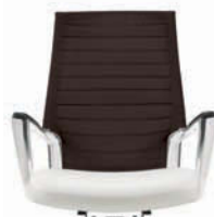
Chocolate Fountain (VU13)