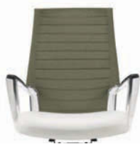
Ivy Moss (VU17)