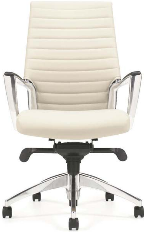
2670-2 High Back Knee-tilter in Allante, Bisque (A42E).