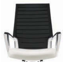
Coal Black (VU19)