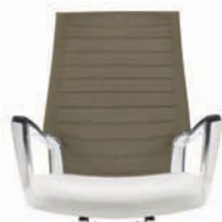
Sandy Beach (VU10)