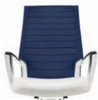
Tidal Wave (VU16)