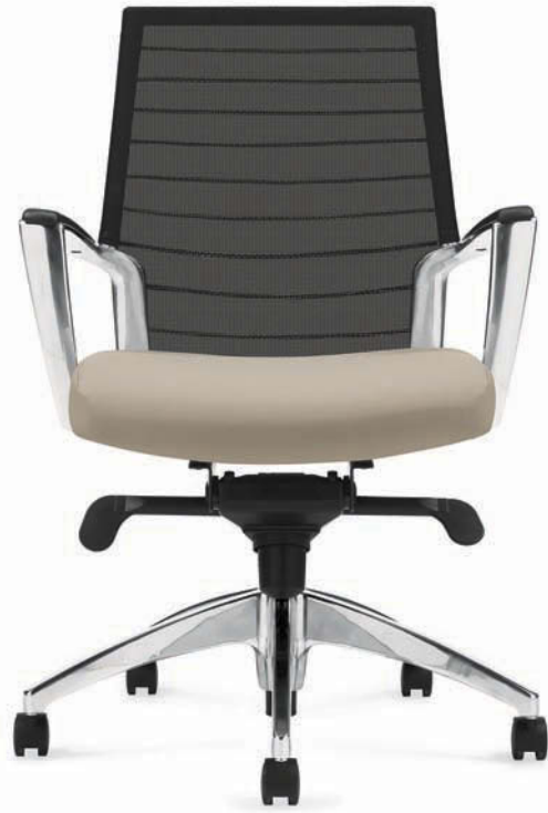
2677-2 Medium Back Knee-tilter Mesh in Allante, Light Parchment (A31E).

Global Accord Mesh is our latest addition to the award winning Global Accord seating series designed by Zooley Chu. The breathable mesh back promotes airflow and comfort and gently supports the natural curve of the spine to reduce fatigue during extended meetings.