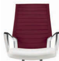
Red Rose (VU18)