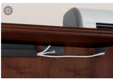
WIRE CHANNELS EASILY MOUNT UNDER WORKSURFACES TO MANAGE WIRE FLOW