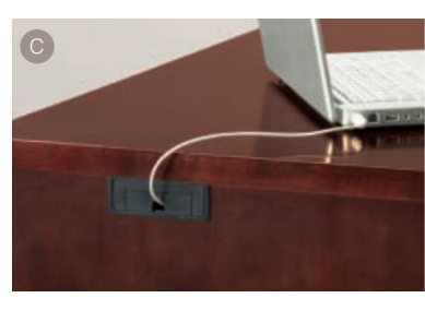
END PANEL GROMMETS DESK, CREDENZA, CORNER, AND MODESTY END PANELS ARE STANDARD WITH GROMMETS AND ALLOW CONTINUOUS WIRE FLOW WITHIN SINGLE AND ADJACENT WORKSTATIONS.