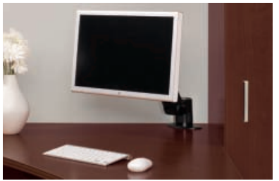
VESA COMPATIBLE MONITOR SUPPORT ARM KEEPS DESKTOPS CLUTTER-FREE AND FEATURES 360° SWIVEL CAPABILITIES, HEIGHT, TILT AND DISTANCE