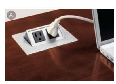
TILT-UP POWER UNITS OPTIONAL POWER UNITS CAN BE SPECIFIED ON WORKSURFACE TOPS TO ALLOW FOR CONVENIENT TECHNOLOGY ACCESS AT WORKSURFACE LEVEL. POWER/DATA UNITS ALSO AVAILABLE.