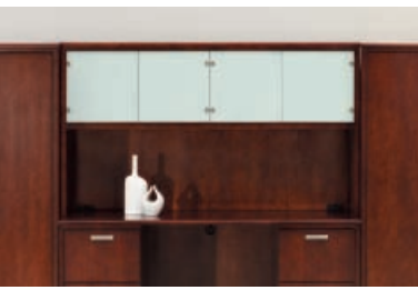
GLASS ACCENTS STORAGE OVERHEAD CABINETS ARE AVAILABLE WITH WHITE OR MOCHA BACK PAINTED GLASS DOORS AND FEATURE EXPOSED SATIN NICKEL HINGES. 42-INCH TALL ORGANIZERS ARE STANDARD WITH A WOOD TRIM TOP PANEL THAT COORDINATES WITH WORKSURFACE EDGE PROFILE. MONITOR ARM VESA COMPATIBLE MONITOR SUPPORT AI DESKTOPS CLUTTER-FREE AND FEATURE SWIVEL CAPABILITIES, HEIGHT, TILT AND ADJUSTMENT, AND INTEGRATED CABLE MANAGEMENT.