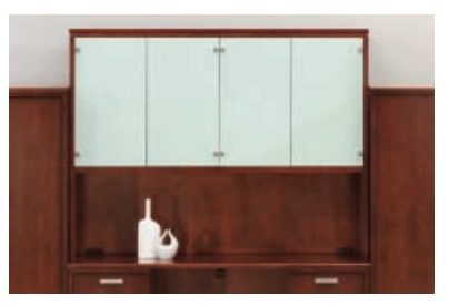
DOUBLE HEIGHT STORAGE OVERHEAD CABINETS 54-INCH TALL DOUBLE HEIGHT STORAGE OVERHEAD CABINETS INCREASE VERTICAL STORAGE WITHIN SMALLER FOOTPRINT WORKSPACES. THESE CABINETS MAY BE SPECIFIED WITH OR WITHOUT A WOOD TRIM TOP PANEL THAT COORDINATES WITH WORKSURFACE EDGE PROFILE.