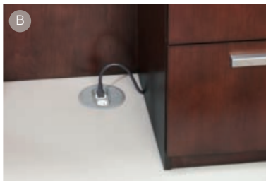
PEDESTAL ACCESS SPACE AN INSIDE PEDESTAL ACCESS SPACE AN INSIDE PEDESTAL ACCESS SPACE BETWEEN MODESTY AND DRAWER BACKS ALLOW FOR UNINTERRUPTED WIRE FLOW AND EASY ACCESS TO EXISTING BUILDING FLOOR POWER AND DATA RECEPTACLES.