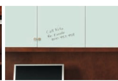
WRITE-ON SURFACES GLASS SURFACES DOUBLE AS ERASABLE MARKER BOARDS FOR QUICK AND EASY NOTES OFFERING AN ENVIRONMENTALLY FRIENDLY OPTION TO PAPER.