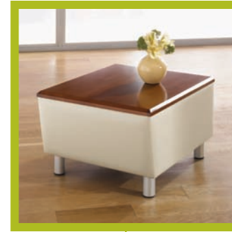
Modular Table featuring a Laminate or Veneer Top