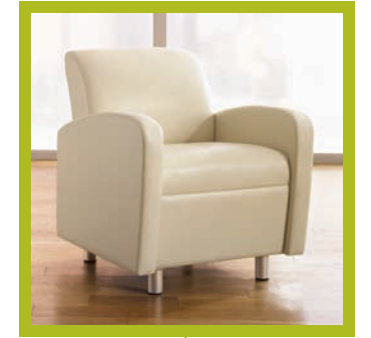
Modular Lounge Chair shown with Optional End Arms