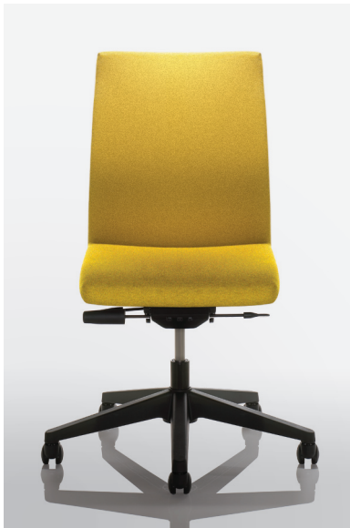
SA10 - Maharam Messenger MG034 Citrus