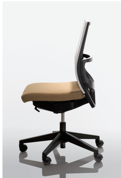
SA12 - MGR Grigio & Maharam Messenger MG010 Zinc