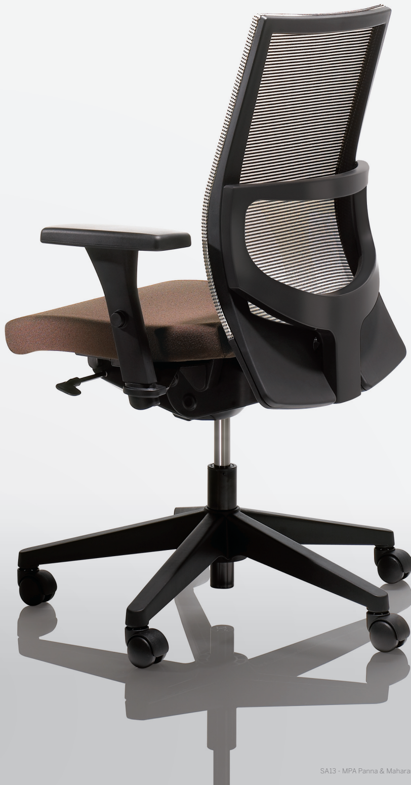
SA13 - MPA Panna & Maharam Medium MD007 Espresso

The synchro-mechanism, lumbar support, and adjustment features can be tailored to fit the body to provide superior ergonomic seating comfort. Individual modifications can be made simply and intuitively. A highly efficient chair in structure and performance, Saggio™ inspires users with both comfort and energy – making it the perfect support for today's fast-paced office space.