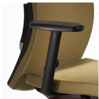
FA Arms - Standard fixed arms.