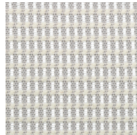
MGR - Grigio soft mesh