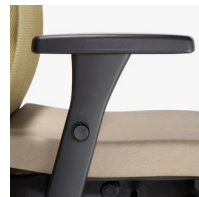
4D Arms - Optional height adjustable arms with pivoting, front-to-back and side-to-side adjustable armrests.