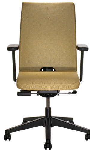
SA11 Fully upholstered model shown in C.O.M.