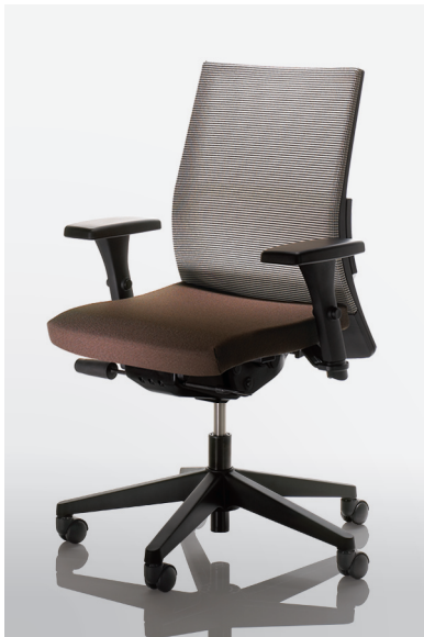
SA13 - MPA Panna & Maharam Medium MD007 Espresso