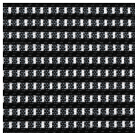
MNE - Nero soft mesh