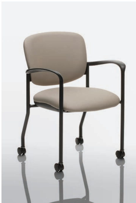
BR32C - Momentum Max MX03 Coquito