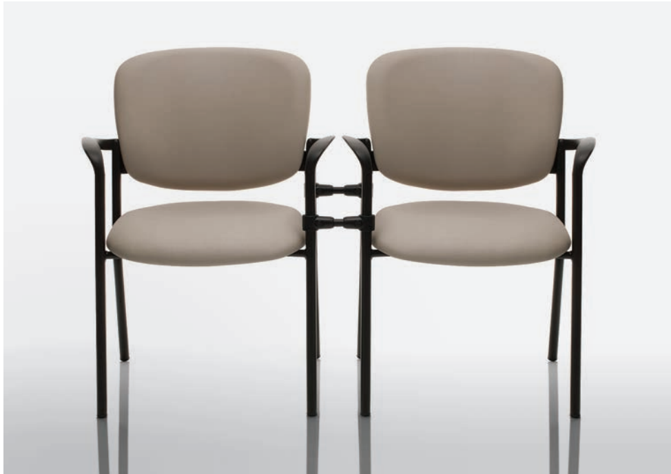
BR32 - Momentum Max MX03 Coquito ganged with BRT-AG connectors