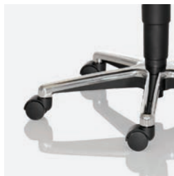
Optional chrome base