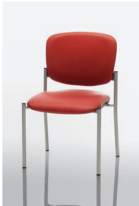
BR31 - Silvertex Vinyl SL12 Sunkist

The guest chair is as “comfortable” in the lobby as it is in a private office, conference setting or break room. Brylee guest seating can be stackable for storage in the wall saver leg version. A caster version to compliment your interior choices.