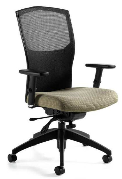
1961-2 High Back Knee-Tilter (no Headrest), shown in GIG GIG1 Stone. Also, shown on cover in Momentum 0HS Warmth 0H12