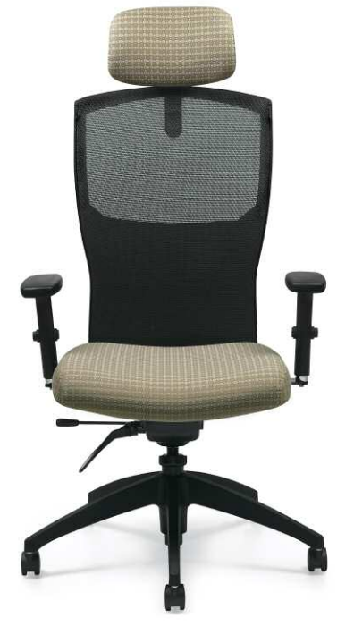
1960-2 High Back Knee-Tilter with adjustable Headrest, shown in GIG GIG1 Stone

In today's modern office where computer related activities are crucial, it is extremely important that one's choice in seating encourages comfort and productivity. Alero's fully upholstered or breathable mesh back and comfortable padded seat create the perfect blend of comfort and design. Many adjustable features and a choice of functional mechanisms ensure the chair will perform well. Choose a sophisticated Multi-tilter for computer intensive activities or a tilter chair for casual offices or meeting rooms. All chairs feature an adjustable lumbar support that allows the user to customize the comfort of the back.