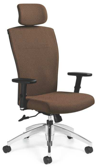
1966-4 Upholstered High Back Tilter with adjustable Headrest, shown here and on cover in Sprinkle S104 Copper