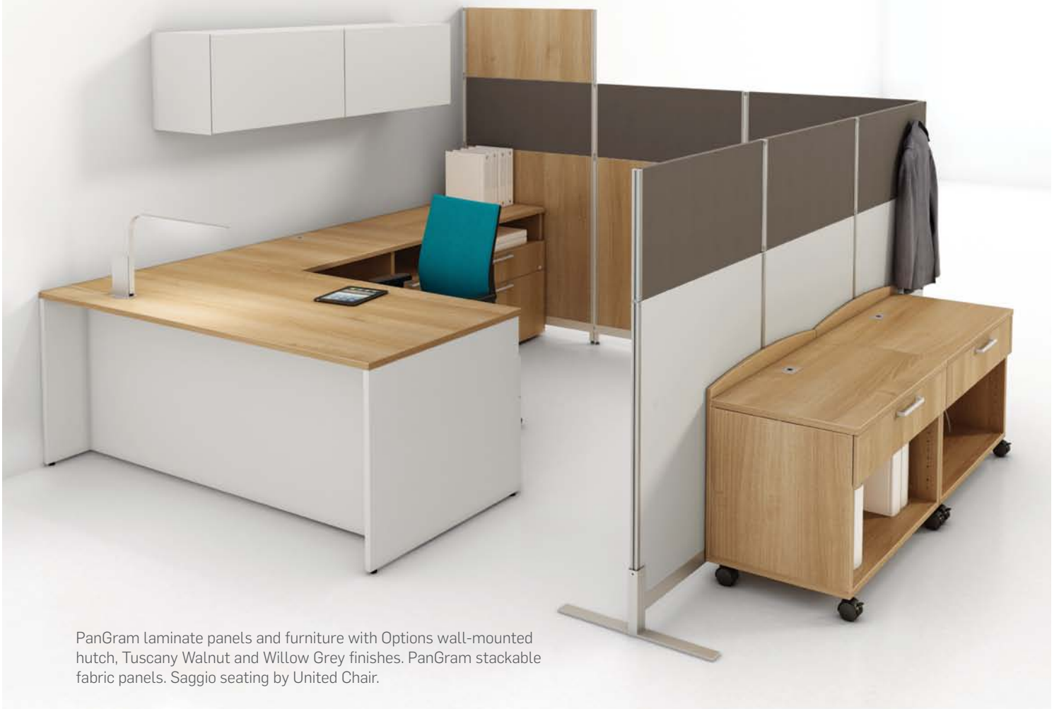
PanGram laminate panels and furniture with Options wall-mounted hutch, Tuscany Walnut and Willow Grey finishes. PanGram stackable fabric panels. Saggio seating by United Chair.

PanGram: Highly flexible! > Every office is subject to an array of individual needs and preferences. Some need space while others desire a little more privacy. Common areas are today's reality, but their configuration can be a real puzzle. This is why we designed PanGram. The vast selection of furniture, panels and screens will help you create the right combination for privacy and functionality, simply and efficiently. PanGram represents versatility at its best! Compatible with all our Lacasse office furniture collections, the individual elements add color and architectural sophistication to your environment. Simply amazing!