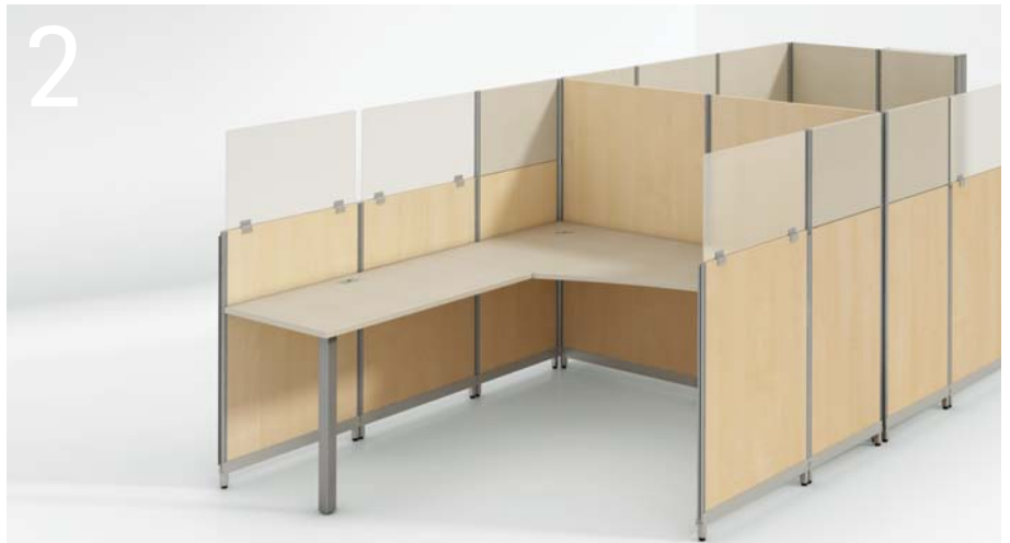
Step 2 - Attach work surfaces to the panels.