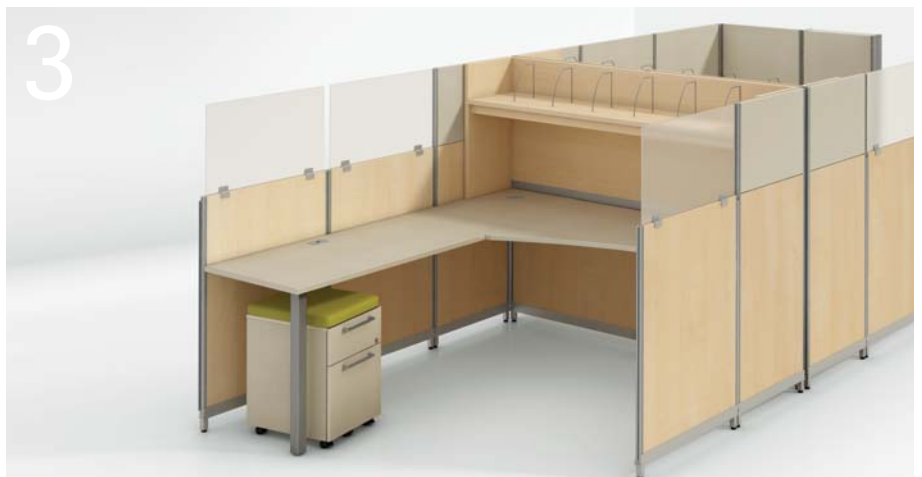
Step 3 - Complete your work environment by adding mobile storage units, hutches, shelves, rails and accessory holders. All you need now is a comfortable chair and you are good to go!