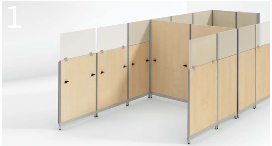
Step 1 - Structure your environment with laminate panels, stackable fabric panels and frosted translucent screens from the PanGram collection series.