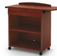
P1VA-ME213641U CER + P1NN-WS12 CER + PNVA-HD21 CER