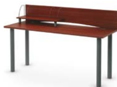
P1NA-TR2466GR CER + PNVA-SH30 CER + PNNN-SC66 CER + 2x TNNA-VTL2