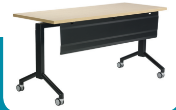
Optional 20 GA steel modesty panel