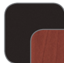
Black Base Cherry Top (BC)