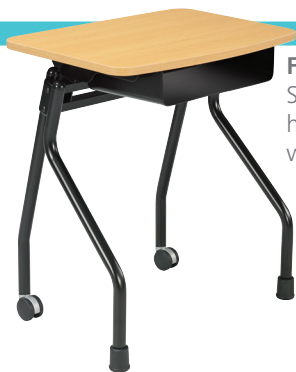
FS2430W Student FLIP Desk high pressure Pearwood with black base