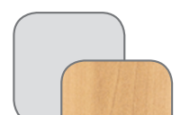
Silver Base Hardrock Maple Top (SHM)