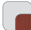
Silver Base Cherry Top (SC)