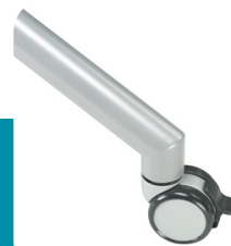
Standard Soft Casters