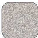
Gray Matrix (GM)