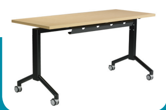
Optional Swing Wire Management