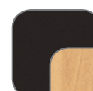
Black Base Hardrock Maple Top (BHM)