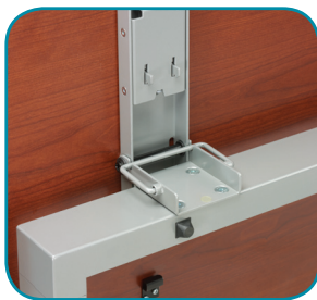
Easy-to-operate flip table features built-in safety.

RA FLIP tables are ideal for multi-use rooms that require a variety of furniture configurations. Nested tables require minimal storage footprint; casters provide easy mobility.