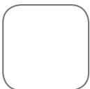
Galaxy White (GW)