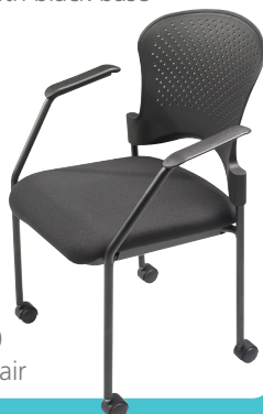
CS2000 Side Chair