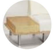
20" END CONSOLE