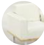
5" FULLY UPHOLSTERED