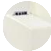
10" ARM POWER

OPTIONAL FLIP-UP POWER AND DATA CENTERS MAY BE SPECIFIED IN ARMS OR TABLE CONSOLES. AVAILABLE IN SILVER OR BLACK PLASTIC.