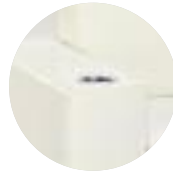
ARM DRINK HOLDER

OPTIONAL DRINK HOLDERS MAY BE SPECIFIED IN ARMS OR TABLE CONSOLES. AVAILABLE IN SILVER, COFFEE, OR BLACK METAL TOP TRIM WITH INSIDE RUBBER COASTER.