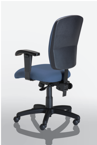
RD11 - Shown in C.O.M.