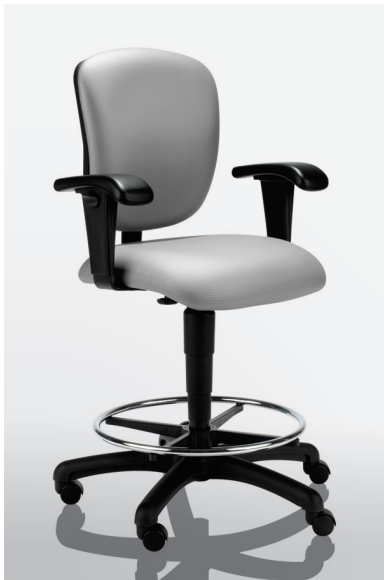
RD8 - Shown in C.O.V.