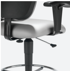
Swivel seat mechanism on stool.