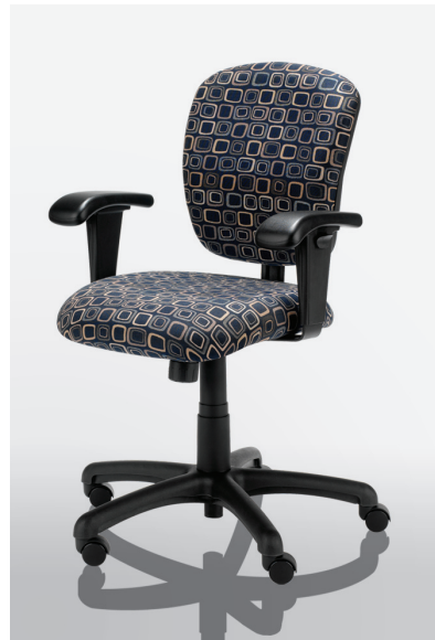
RD6 - Shown in C.O.M.

A design that guarantees dependability and performance.