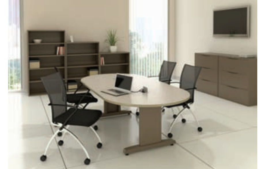
Conference Table, Lateral Files and Bookcases in Sand Beige Paint with Classic Rock laminate conference surface. Valoré TSH1 Chairs with Black mesh back and fabric seat.

Please visit our website for more information: Mayline.com