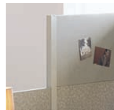
Fabric Panels can be stacked and ganged to create many unique combinations.

CSII provides all sorts of ways to promote interaction, enhance focus and support individual work styles – even within a single workstation. Stackable fabric panels allow varying degrees of privacy. Storage components can be used to define boundaries as effectively as they keep work close. "P" and "J" tables offer conferencing flexibility even as they conserve valuable real estate. Get the most out of your space with CSII.