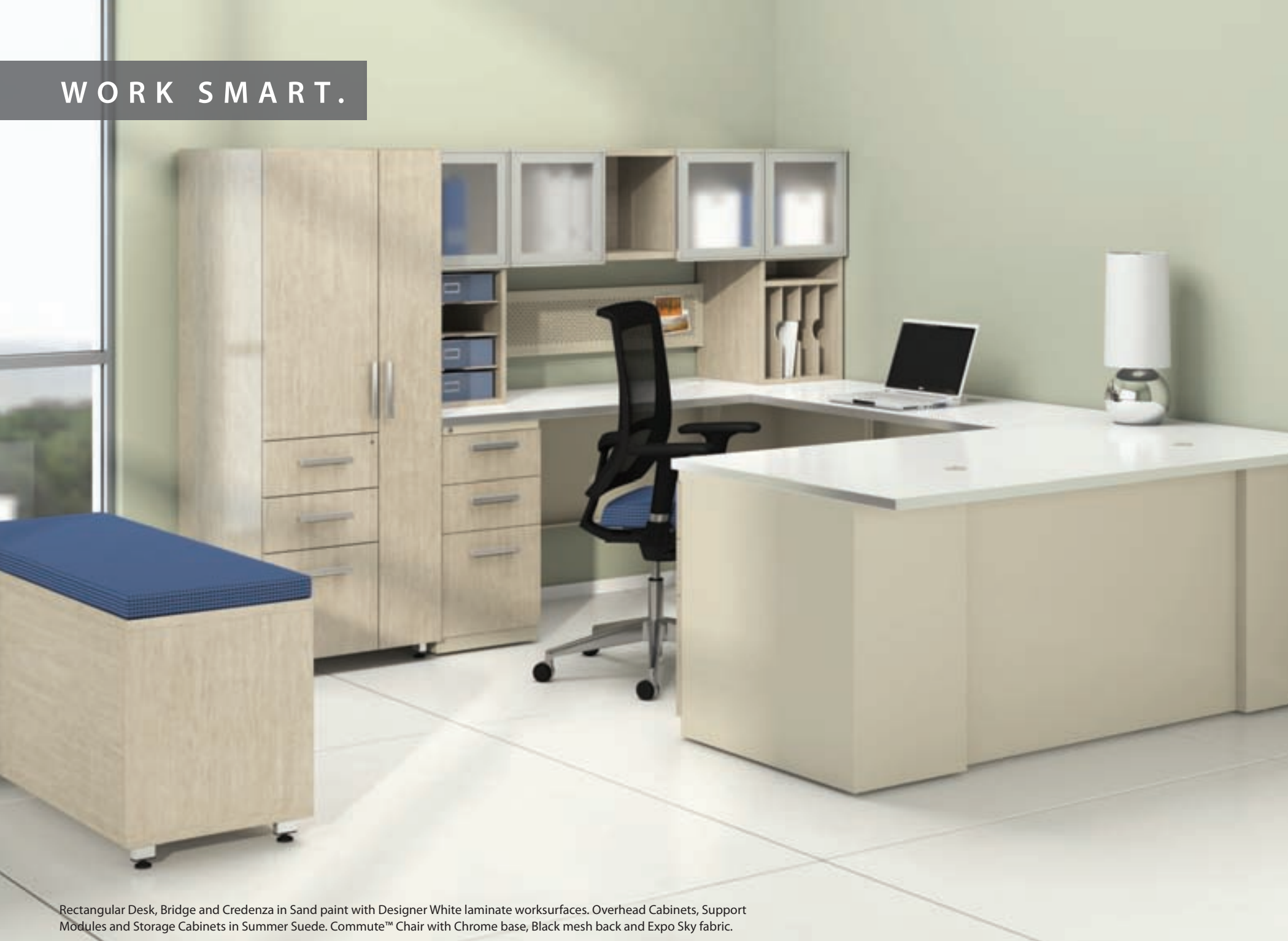
Rectangular Desk, Bridge and Credenza in Sand paint with Designer White laminate worksurfaces. Overhead Cabinets, Support Modules and Storage Cabinets in Summer Suede. Commute™ Chair with Chrome base, Black mesh back and Expo Sky fabric.

CSII includes a number of features that enhance productivity, efficiency and user satisfaction. Expansive desk surfaces provide plenty of room to spread out work. Storage components run the gamut from under-surface to eye-level to overhead, in configurations that suit any set of job responsibilities. Streamlined aesthetics adapt well to the personal touches that make an office more comfortable. It's a smart investment for your workplace and your workforce.