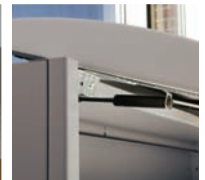
"Soft Close" system provides safe, secure and quiet closure of Flipper Doors.