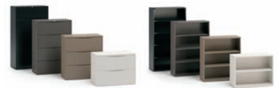
Steel files and bookcases align dimensionally with CSII Desking and Hutches.