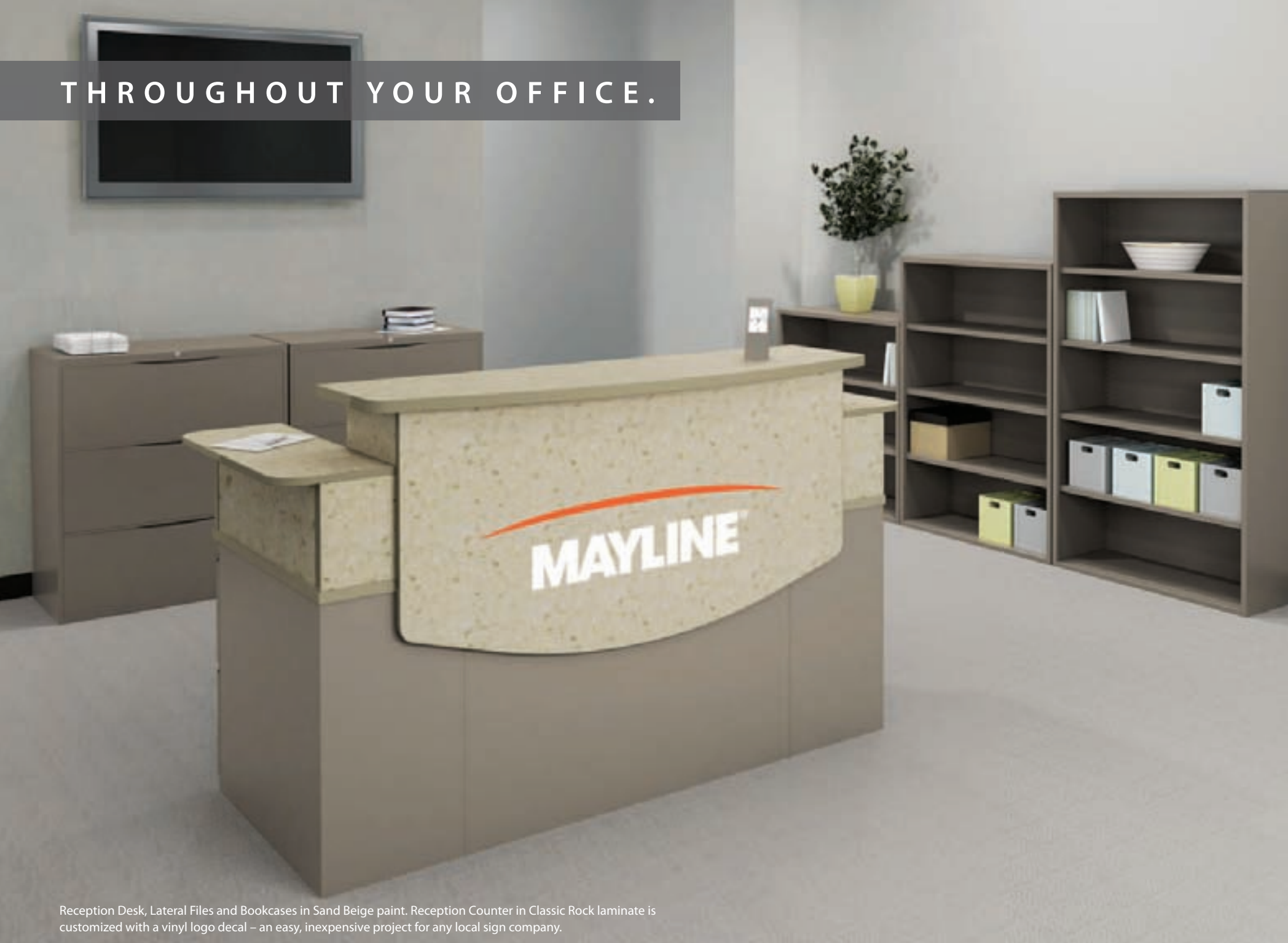
Reception Desk, Lateral Files and Bookcases in Sand Beige paint. Reception Counter in Classic Rock laminate is customized with a vinyl logo decal – an easy, inexpensive project for any local sign company.

CSII enables you to create a unified look, feel and function throughout your organization. Reception desks, conference tables, lateral files, bookcases and other storage components complement our workstation products – and deliver the same long-lasting durability and attention to design detail.