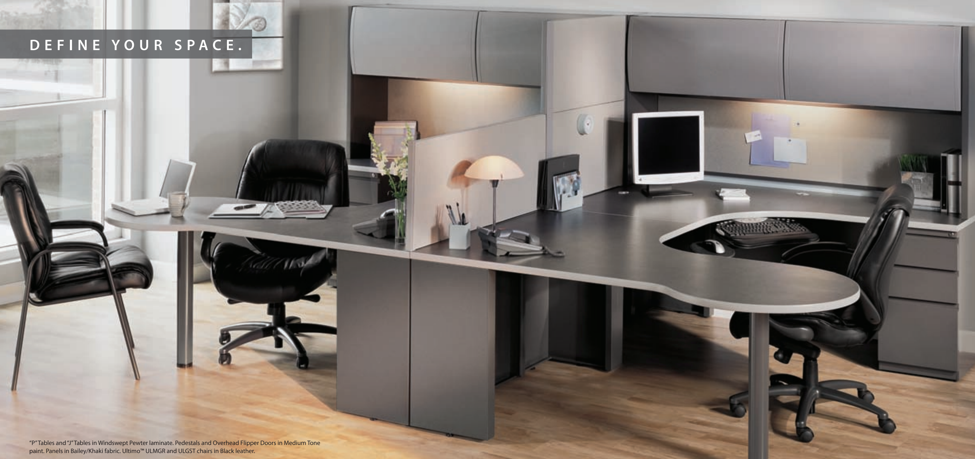
"P" Tables and "J" Tables in Windswept Pewter laminate. Pedestals and Overhead Flipper Doors in Medium Tone paint. Panels in Bailey/Khaki fabric. Ultimo™ ULMGR and ULGST chairs in Black leather.

CSII provides all sorts of ways to promote interaction, enhance focus and support individual work styles – even within a single workstation. Stackable fabric panels allow varying degrees of privacy. Storage components can be used to define boundaries as effectively as they keep work close. "P" and "J" tables offer conferencing flexibility even as they conserve valuable real estate. Get the most out of your space with CSII.