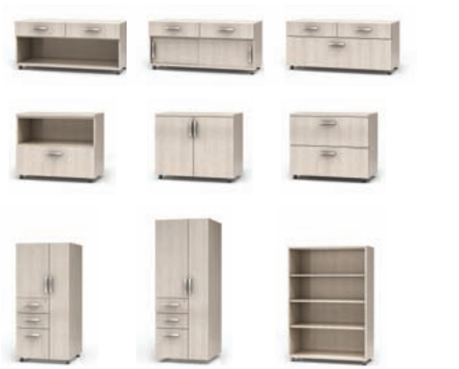
Laminate storage components are available in six colors and even more configurations than you see here.