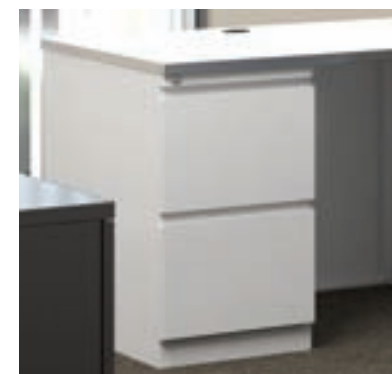
Pedestals (and Table Legs) are non-handed to simplify specifying and installing.

Tough doesn't mean inflexible when it comes to CSII. It will adapt to a wide variety of environments, from open plan to private office. Worksurfaces are available in numerous shapes and sizes. Abundant storage options solve any filing, piling and archival need. It's all easy to specify, install and reconfigure, so it can grow and change along with your organization. CSII will rise to any challenge, now and in the future.