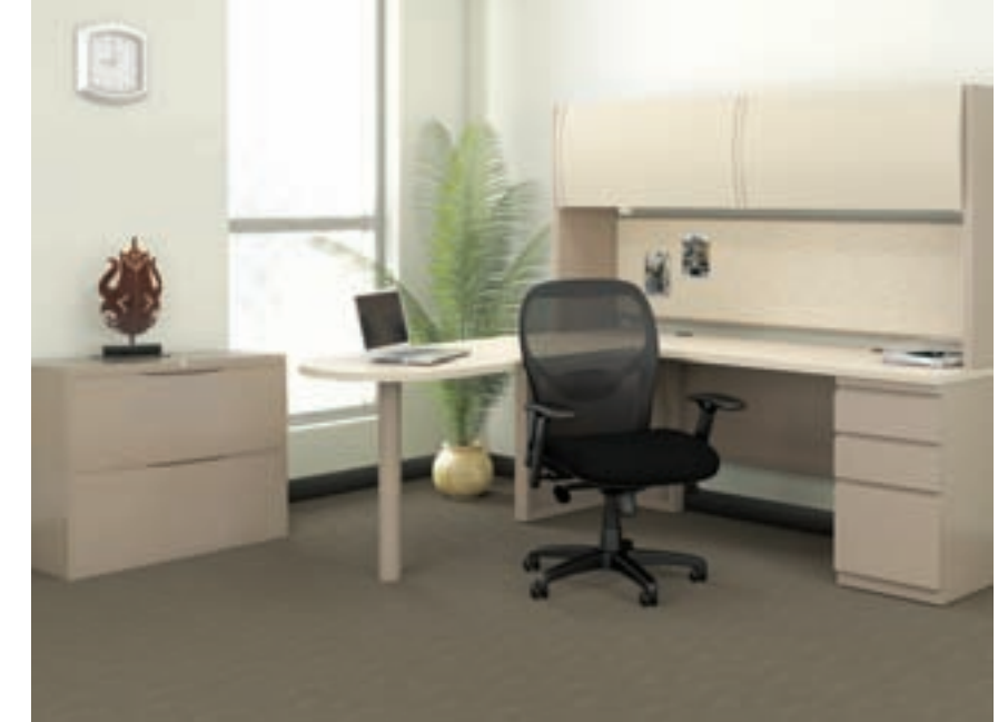
Peninsula Table, Credenza with Pedestal and Overhead Flipper Door in Warm White paint with Classic Rock laminate worksurfaces. Mercado Series 3200 Chair with Black fabric seat and mesh back.

CSII includes a number of features that enhance productivity, efficiency and user satisfaction. Expansive desk surfaces provide plenty of room to spread out work. Storage components run the gamut from under-surface to eye-level to overhead, in configurations that suit any set of job responsibilities. Streamlined aesthetics adapt well to the personal touches that make an office more comfortable. It's a smart investment for your workplace and your workforce.