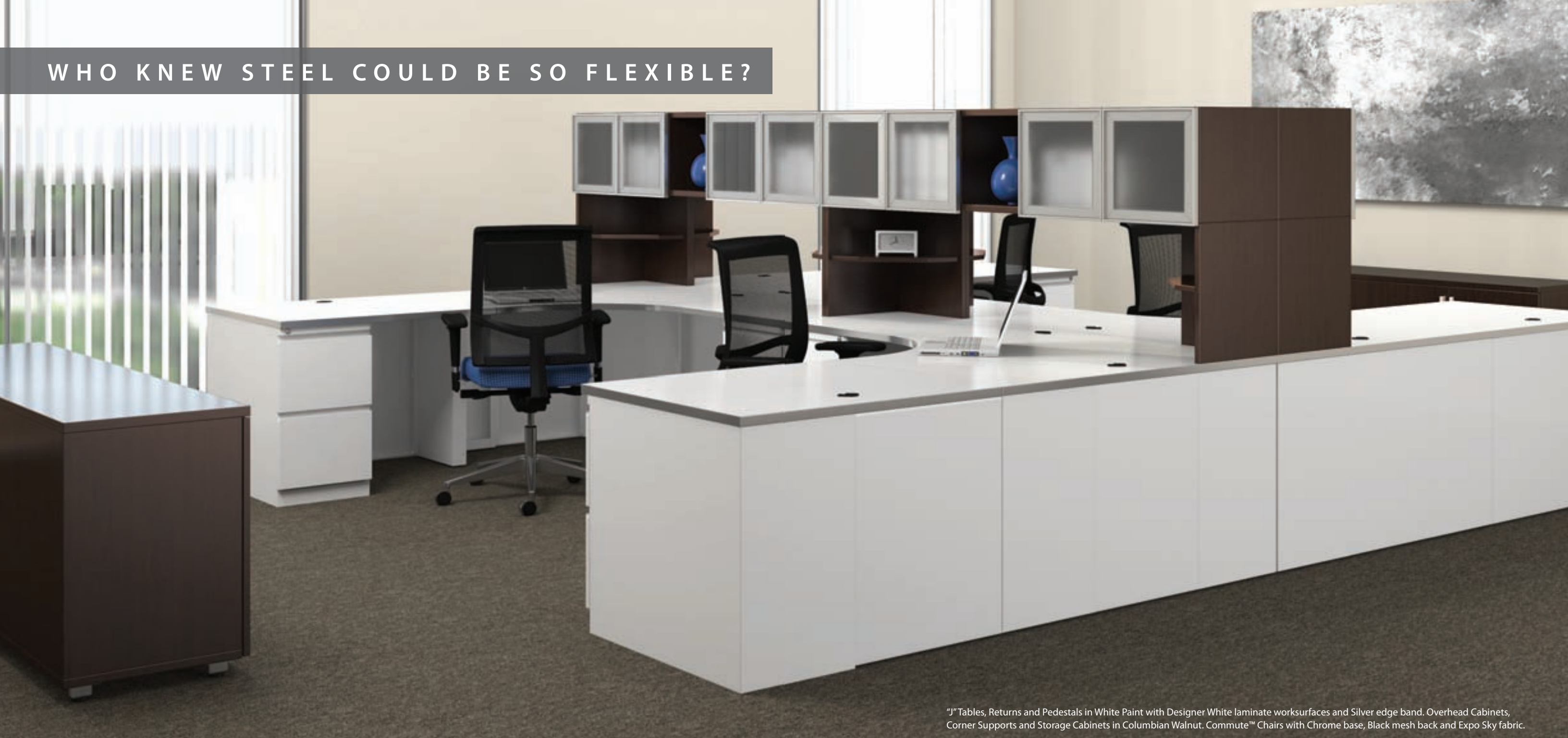
"J" Tables, Returns and Pedestals in White Paint with Designer White laminate worksurfaces and Silver edge band. Overhead Cabinets, Corner Supports and Storage Cabinets in Columbian Walnut. Commute™ Chairs with Chrome base, Black mesh back and Expo Sky fabric.

Tough doesn't mean inflexible when it comes to CSII. It will adapt to a wide variety of environments, from open plan to private office. Worksurfaces are available in numerous shapes and sizes. Abundant storage options solve any filing, piling and archival need. It's all easy to specify, install and reconfigure, so it can grow and change along with your organization. CSII will rise to any challenge, now and in the future.