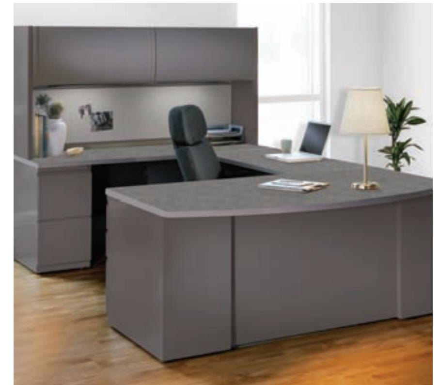
Bowfront Desk, Straight Bridge, Credenza with Pedestal and Overhead Flipper Door in Medium Tone paint with Windswept Pewter laminate worksurfaces. Comfort Series Big & Tall Chair in Black fabric.