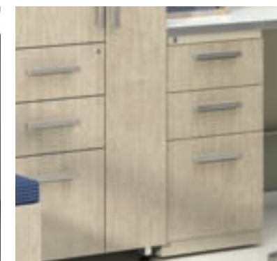
Laminate storage components add warmth and dimension to your CSII station.