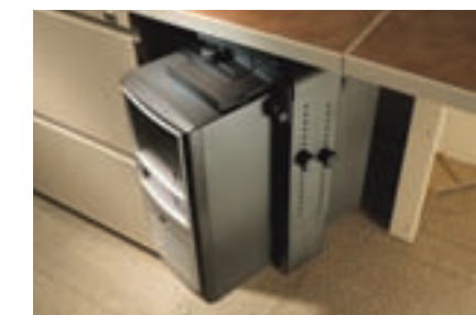
A CPU Holder is one of many support products that makes users more productive.