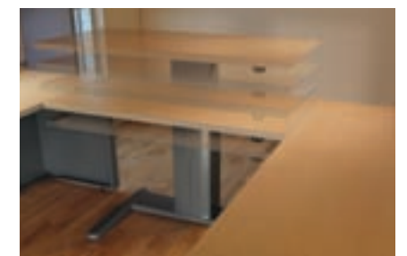
Freestanding Height-adjustable Desks promote healthy movement throughout the day.