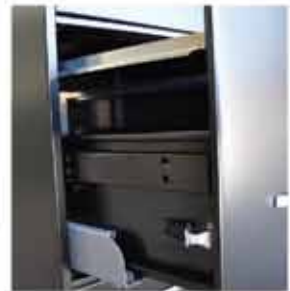
Heavy Gauge Triple-Tied Steel Cradle Suspension

All Invincible™ Vertical file cabinets are available in letter and legal widths with a 28 inch depth.