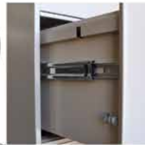
Steel Ball Bearing Suspension