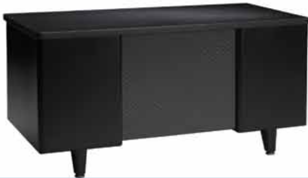
M-Line with Steel Top