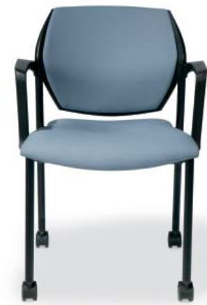
< Fully upholstered Ten with casters. >

Design, Comfort and Flexibility. The Ten series chairs are available in six thermoplastic colors or with an upholstered seat & back for added comfort. Ten is also available in a black or silver wall saver frame with a basic task or swivel tilt control and comes with or without arms.