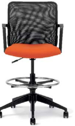
Ten stool with mesh back. >

With Ten mesh smart new look and a choice of stool, side or task version and a variety of fabric seats to choose, Ten mesh will blend right in with any office décor. Its wall saver frame is available in both silver and black. When it comes to strength, durability and sustainability, Ten's 13 gauge 1" diameter steel frame with Highmark's lifetime warranty will knock any competitor out of the ball park and it's rated up to 300 lbs. Mix and match both Ten and Ten mesh to any office environment to make that design touch at an eye-catching price point.