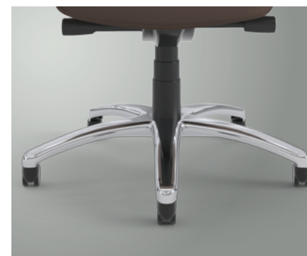
Brushed Aluminum Base