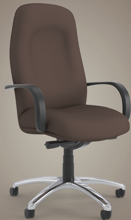
UPHOLSTERY: Messenger Coffee by Maharam // Fixed Arms // BASE: Aluminum