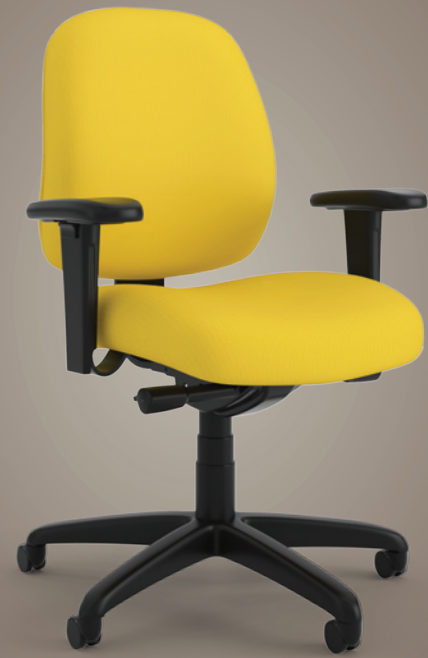
UPHOLSTERY: Medium Prospect by Maharam // Adjustable Arms // BASE: Black