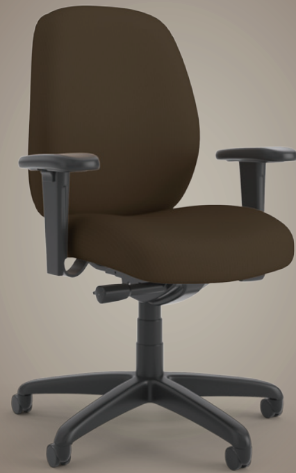
UPHOLSTERY: Medium Espresso by Maharam // Adjustable Arms // BASE: Black