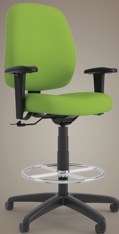
UPHOLSTERY: Messenger Neon by Maharam // Adjustable Arms // BASE: Black