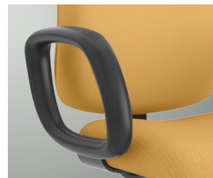
Task Fixed Arm