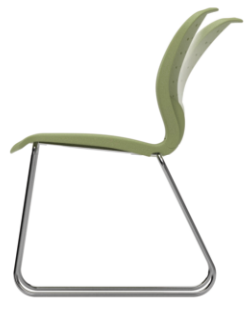
Shown in Sage

312695_PM_C_Volley_r1.indd 5 10/25/11 7:32 AM