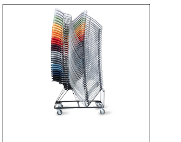
Chairs stack 9 high on ground. Using optional DL2 cart, AP (all plastic) chairs may be stacked 33 high while still offering clearance through an 80" doorway. More than 33 chairs may be stacked on optional DL2 cart in open areas.