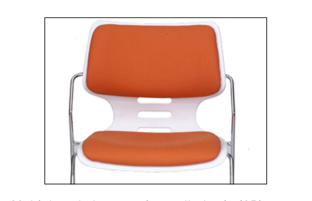
Multiple upholstery options: all plastic (AP), upholstered seat (US), and upholstered seat and back (UP).