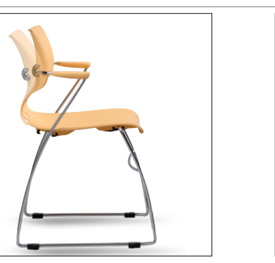
Posture-Flex Technology® offers 15 degrees of back recline. Sliding movement of seat and flex in the back, not only contribute to user comfort, but also helps to keep the user alert while seated for long periods of