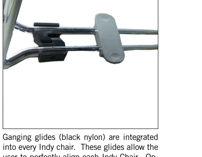
into every Indy chair. These glides allow the user to perfectly align each Indy Chair. Optional top ganging clip GC3 (gray nylon) may be added to firmly attach two chairs.