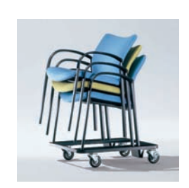
Stacking Achieve stacks four-high on the floor and five-high on the stacking cart.