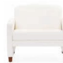
31-INCH SEAT WIDTH