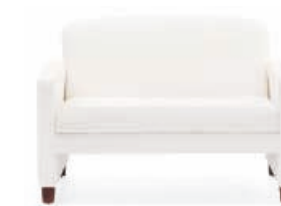
42-INCH SEAT WIDTH