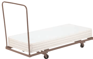
RECTANGLE TABLE CADDY

NPS-DY3072 Table capacity 10-12 folding tables