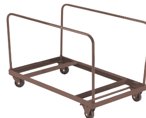
ROUND TABLE CADDY

NPS-DY60R Table Capacity 8-10 Round Tables