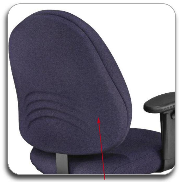
Y133 O99 77 U - <u>Upholstered Outer Back</u> Notice the U as part of the product number when ordering the upholstered outer back option.