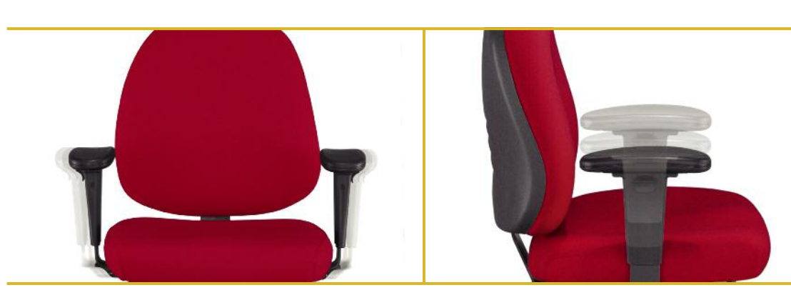
Height and width adjustable arm packages

Genesis has the perfect fit for any situation. Shown above is the standard seat size and the big & tall seat version when you need extra room for comfort, there is a version just right for you! All chairs come with the famous Chromcraft warranty, see the current Price List for complete information and details.