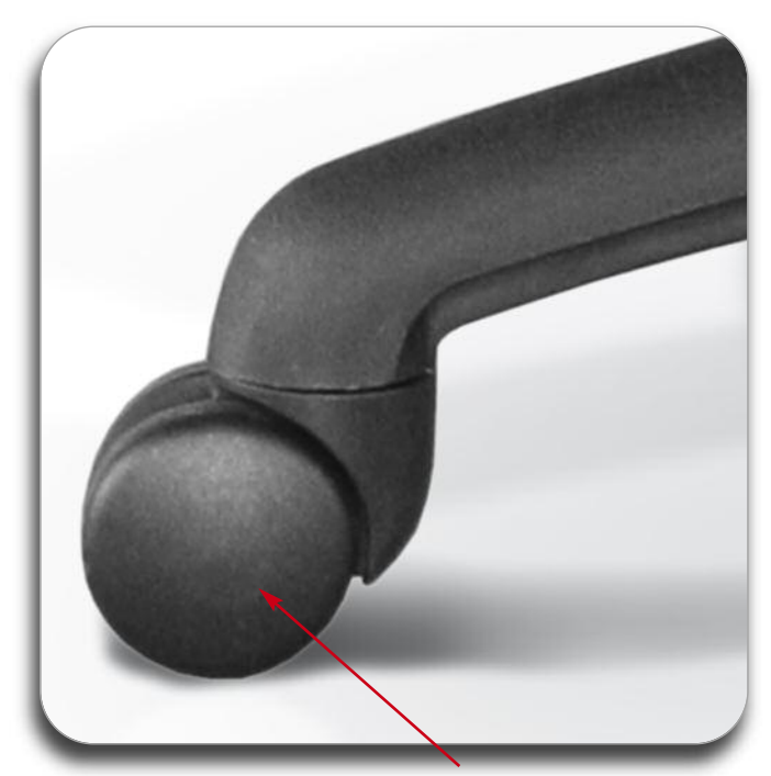
Y133 O99 77K - <u>Soft Dual Wheel Casters</u> Notice the K as part of the product number when ordering the soft caster option.