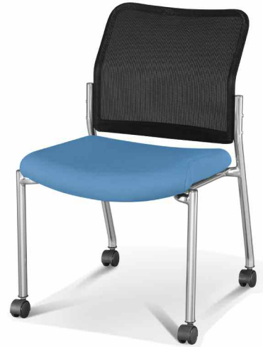
YM41 M5C 01

Facet mesh back frames are ergonomically shaped to follow the natural curve of the human body. The double layered pellicle mesh material offers firm body fitting support and comfort.