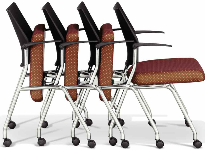
Y942 26C 01