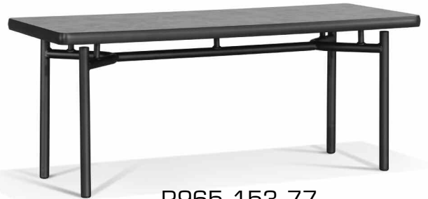
R965 153 77 Magazine Table