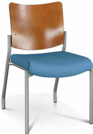
YS31 W55 21C