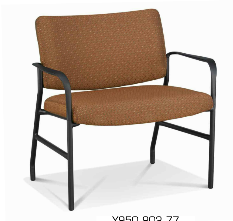
Y950 902 77