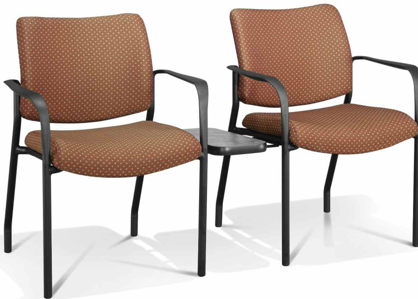
Y930 155 77 (Chairs) R943 151 77 (Table)

Facet has a wall saver frame which minimizes costly scuffs and marks on the wall.