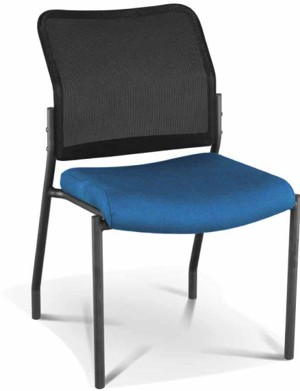
YM41 M55 77