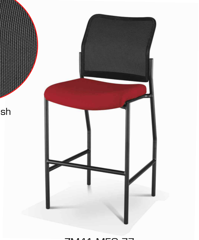
ZM41 M50 77