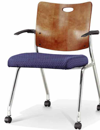
YH32 W6C 01C