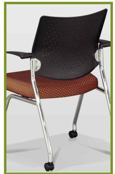
Facet Roll & Fold also has a wall saver frame.