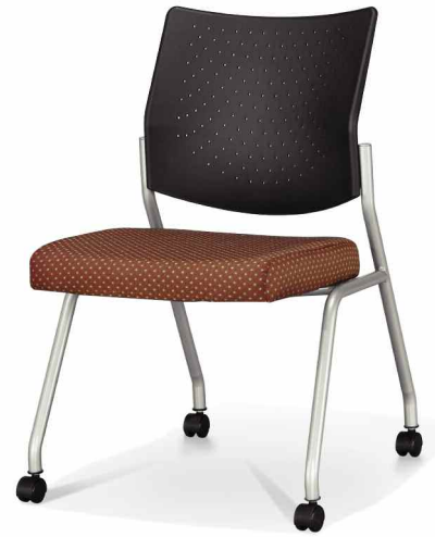
Y943 25C 21