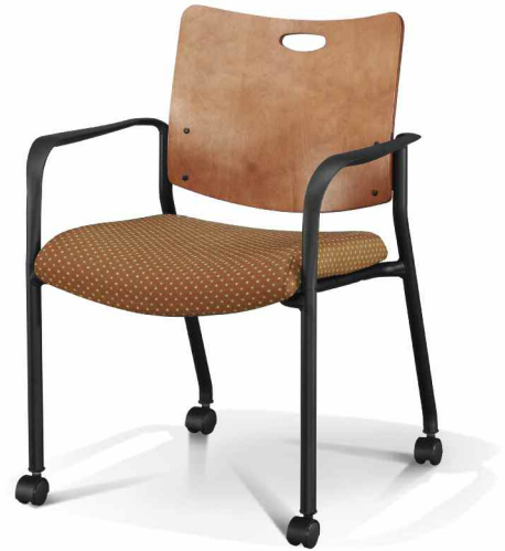
YH30 W5C 77C