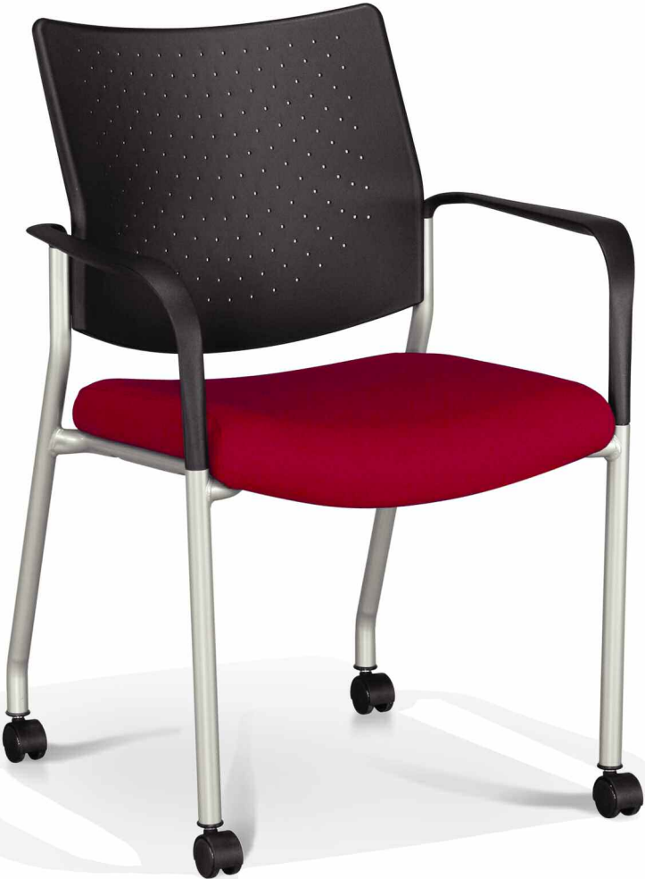
Y940 15C 21