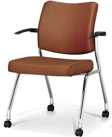
Y932 26C 01