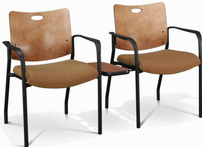
YH30 W55 77C (Chairs) R943 151 77 (Table)