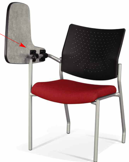
Y947 157 21 Right Tablet