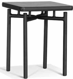
R964 152 77 End Table