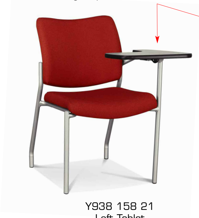
Y938 158 21 Left Tablet

Facet Tablet Arm flips up and has a 2" depth adjustment that moves backward and forward for a wider range of personal comfort.