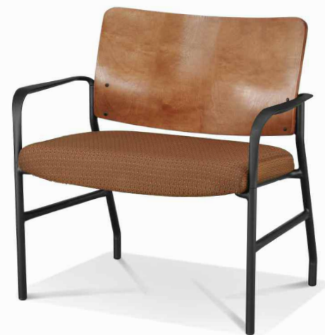
YS50 W02 77C