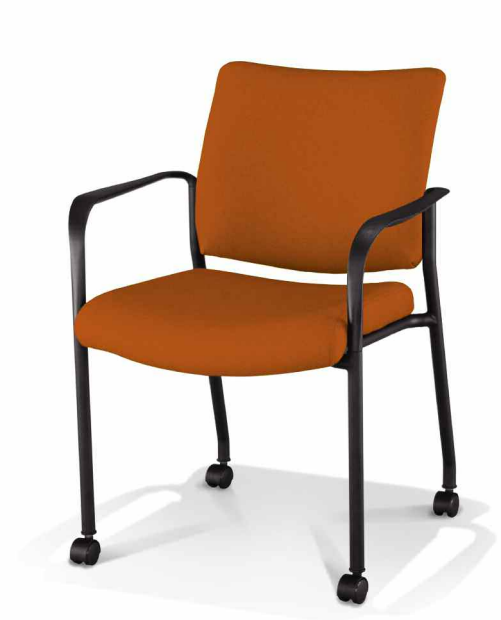
Y930 15C 77