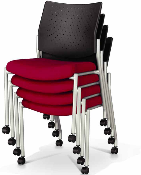
Y941 15C 21