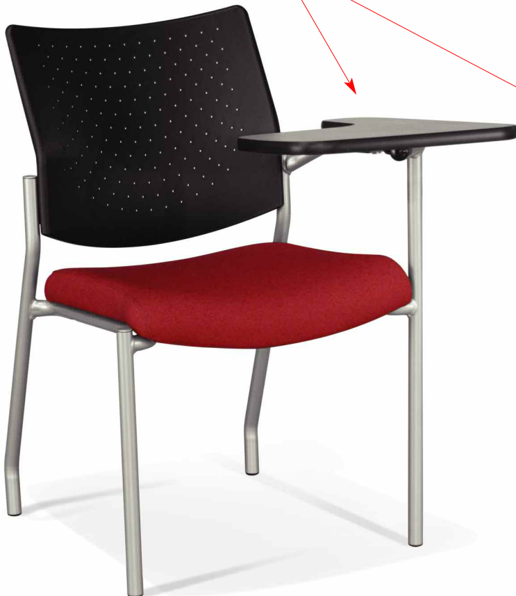
Y948 158 21 Left Tablet

Facet Tablet Arm flips up and has a 2" depth adjustment that moves backward and forward for a wider range of personal comfort