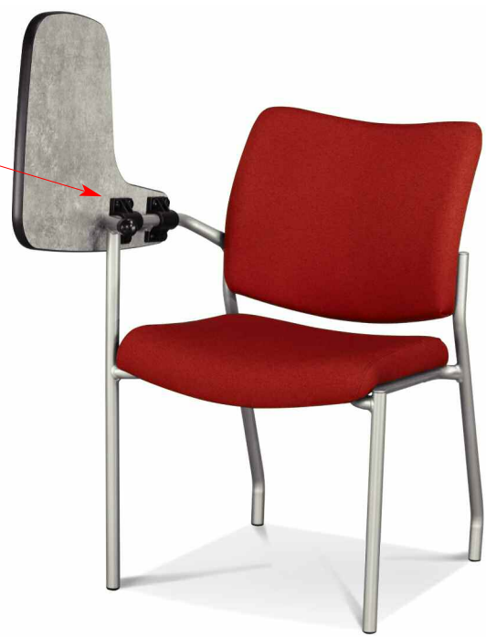
Y937 157 21 Right Tablet