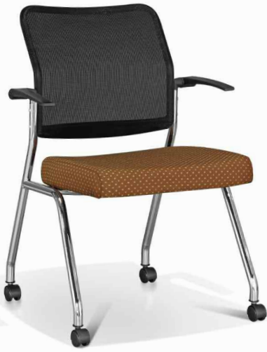
YM42 M6C 01

Facet mesh back frames are ergonomically shaped to follow the natural curve of the human body. The double layered pellicle mesh material offers firm body fitting support and comfort.