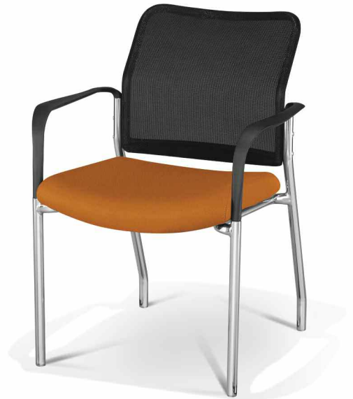
YM40 M55 01