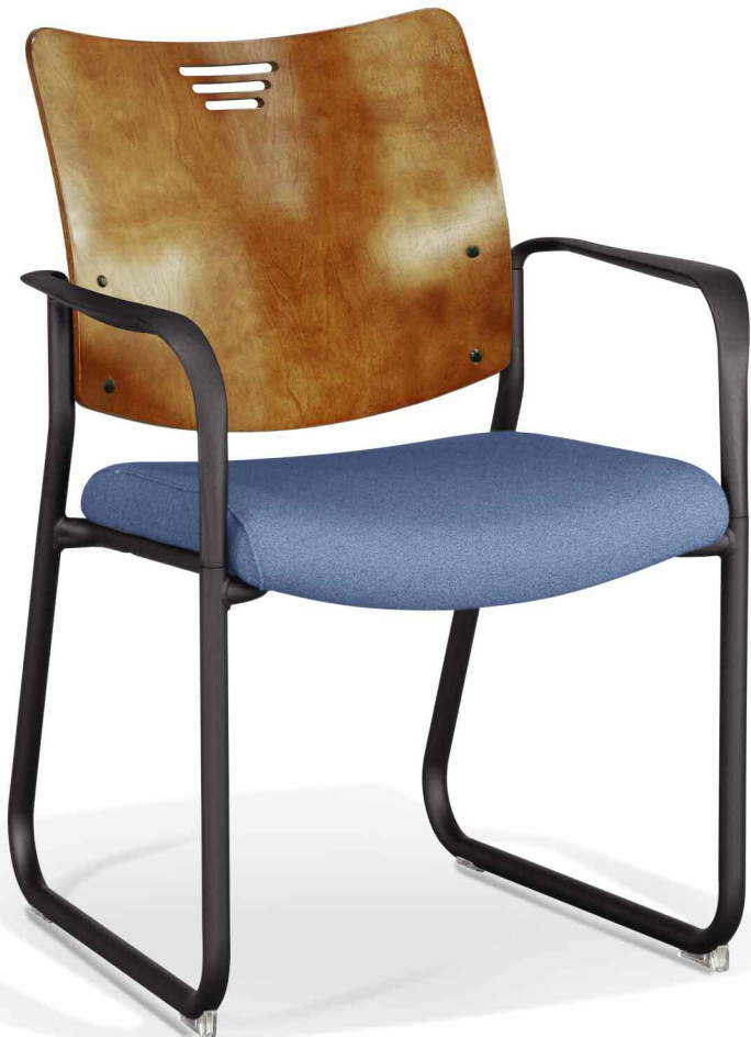
YC34 W56 77C

The one half inch back is comprised of 9 ply finished quality veneers on the inner and outer face.