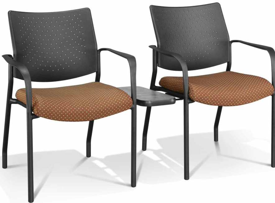
Y940 155 77 (Chairs) R943 151 77 (Table)