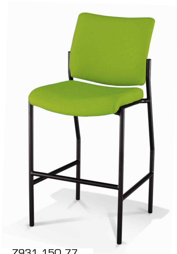
Z931 150 77

Facet Tablet Arm flips up and has a 2" depth adjustment that moves backward and forward for a wider range of personal comfort.