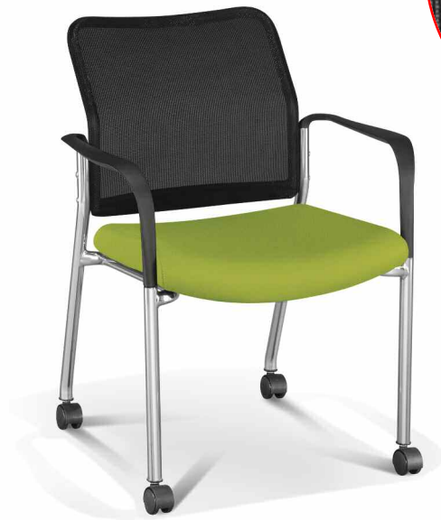
YM40 M5C 01