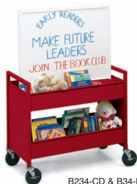
B234-CD & B34-DE

B234 Browser Bin keeps materials out for display and easy pick up. Optional dry erase board mounts to the top shelf. 5" casters.