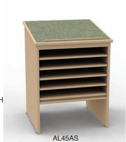
Atlas Stand AL45AS 28"D x 30 1/2"W x 43 1/2"H $2188