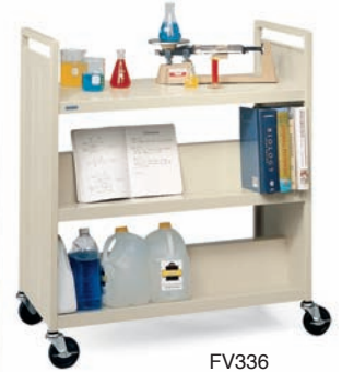
FV336 Putty Beige

L330 Slant-Shelf Library Booktruck features three shelves.