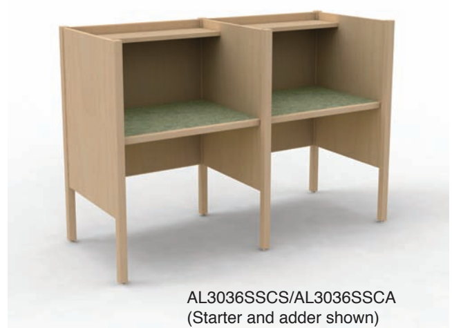
AL3036SSCS/AL3036SSCA (Starter and adder shown)