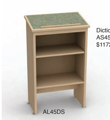
Dictionary Stand AS45DS 45"H $1172

Arlington is a complete line of technical furniture that is simple and open in design while maximizing space in the library environment. Available in both rounded and tapered edge treatments for all work surfaces. Arlington features a large number of wood finishes.