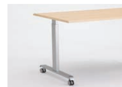
shown with casters

Enwork Impression, sleek and sophisticated, consist of high quality metal with adjustable liverlers or casters. The table surfaces consist of high pressure laminate, 1 1/8" thick with 3mm PVC edges.